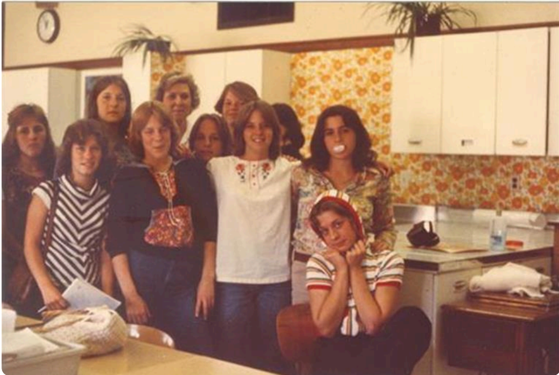
Home Ec. at the old Jr. High on Sixth Street. Maybe 1975 or 76..